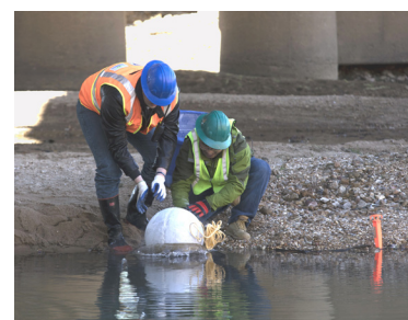
Figure 1: Two gravity-controlled N42 magnets in stack and deployment of one 135-pound smart rock in Roubidoux Creek, Missouri.